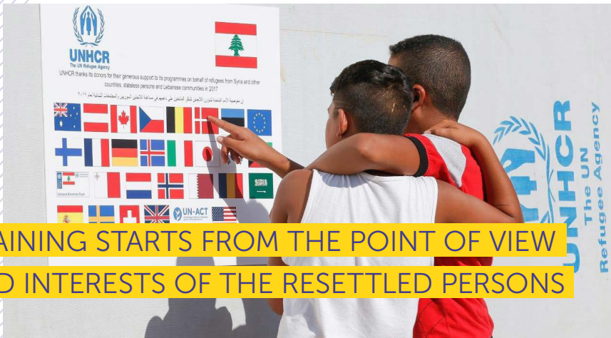
TRAINING STARTS FROM THE POINT OF VIEW AND INTERESTS OF THE RESETTLED PERSONS