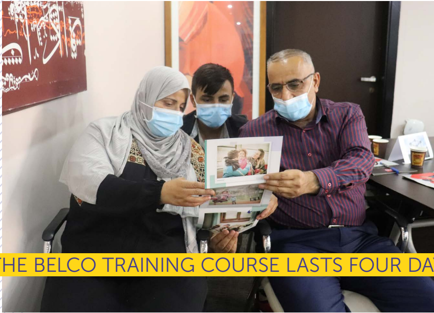
THE BELCO TRAINING COURSE LASTS FOUR DAYS